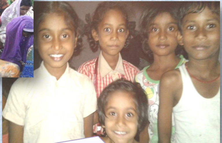
Cheerful kids at Muruganandhal

If you are led to contribute the bank details are given below: