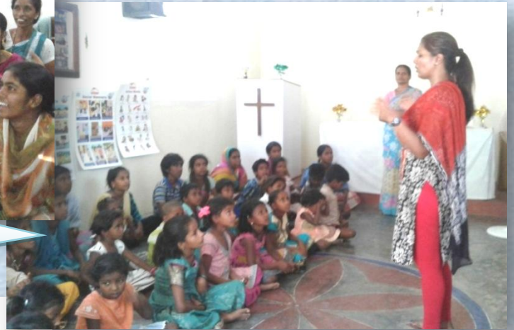
Worship time at Seduvalai Church