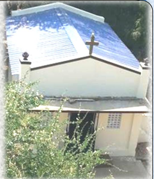
Seduvalai Church after renovation