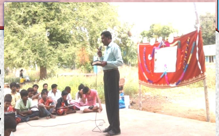
Christmas Programme at Arumbaruthy Gypsy colony, Cheyyar

For the past three years we have been celebrating Christmas in this colony during the Pongal holidays because that is the time all the families are around. During Christmas time they go out to sell their goods. This time many young people participated and glorified God.