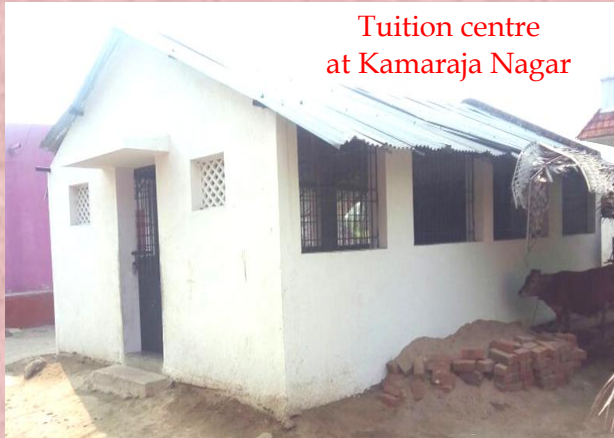
Tuition centre at Kamaraja Nagar

During the Christmas season, a Haggai group and 25 persons from CMCH attended the function at Sethuvalai and they contributed for the Christmas dinner. Thanks are due to them.